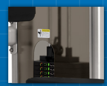
KEVLAR TRANSMISSION BELT FOR EXTENDED LIFE AND EASY REPLACEMENT

INCREASED VISIBILITY THROUGH TRANSPARENT WEIGHT TOWERS