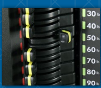
EASY TO USE LOCK N LOAD® TECHNOLOGY ELIMINATES LOST, BROKEN OR BENT PINS