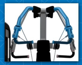
CONVERGING AND DIVERGING ARCS PROVIDE NATURAL FEEL