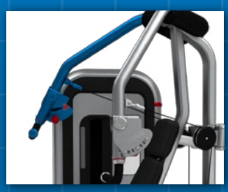
UNILATERAL AND BILATERAL MOVEMENT