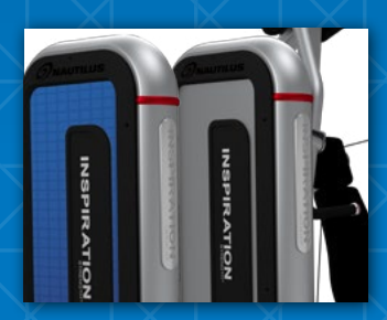
NEW MODERN DESIGN WITH UNIFORM TOWER HEIGHTS AND CUSTOMIZABLE SHROUDS