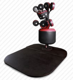
BoxMaster® Tower w/ Base