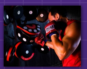
INCLUDES A TOTAL EDUCATION PROGRAM, CLUB MANUAL AND DIGITAL MARKETING KIT. INSTRUCTOR WORKSHOPS ARE AVAILABLE