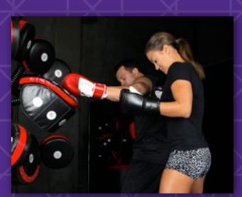
INCORPORATE "PUNCHING ROUNDS" WITH "ACTIVE RECOVERY ROUNDS" TO CREATE GROUP PROGRAMS