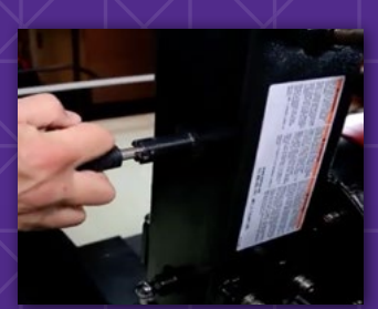
3 EASY TO USE PINS FOR TOWER HEIGHT ADJUSTMENT