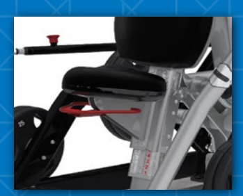
INTUITIVE TOUCH POINTS USER-FRIENDLY GAS SHOCK ASSISTED SEAT ADJUST