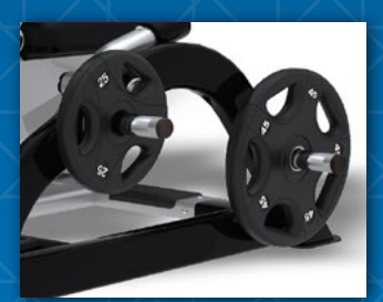
LOW LOAD POINTS FOR SAFE AND SIMPLE USE