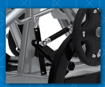
ONE-OF-A-KIND LEVER & PIVOT POINTS FOR OPTIMUM BIOMECHANICS